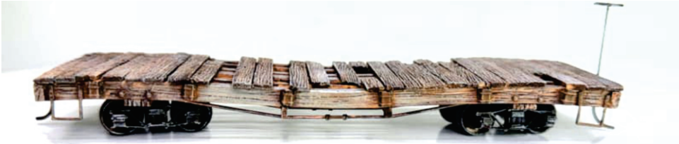
model assembled using On30 Trucks and Kadee Couplers Assembled and painted by James and Anna Cleveland

We offer many detail parts to complete your scene such as crates, barrels, 55 gallon steel drums, pallets, and other details to populate your scene.